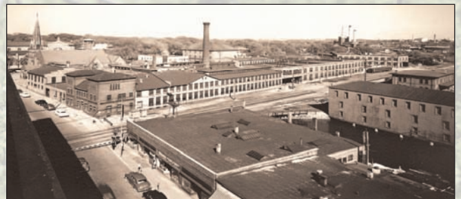
The original American-Marsh facility located in Battle Creek, Michigan, USA (Photo taken around 1950).

knowledgeable customer service staff just as experienced and proven as our pumps. Take a specialized product, and provide a simple process to obtain the information and delivery you require. Our heritage of quality pumps goes back to 1873 and continues today, emphasizing durability in the design and construction of every pump we make. American Marsh Pumps, an American tradition since 1873. Our entire product family reflects years of customer input, product upgrades, redesign and new product development...all focused on meeting and exceeding our customers expectations. For over 135 years, the American-Marsh Pump designs have proven their durability by withstanding the test of time. Our commitment to customer service and satisfaction will ensure that the American-Marsh Pumps Product line will be around for the next 135 years.